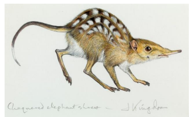
Chequered sengi (Rhynchocyon cirnel)