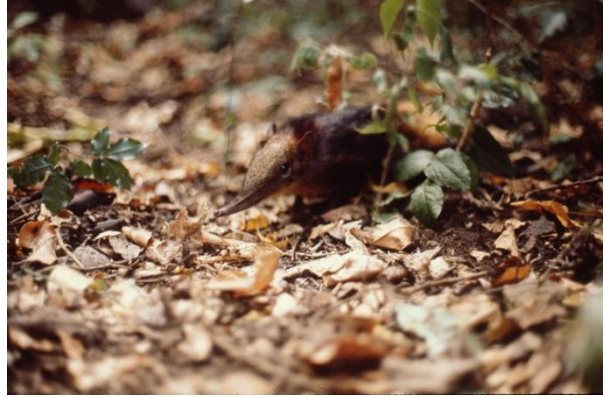
Golden-rumped sengi, Rynchocyon chrysopygus ,

Standing inland of the great Watamu-Malindi Marine Reserves, Arabuko-Sokoke Forest is a stronghold of east African endemism, and the largest intact stretch of coastal forest in the region. Although its range extends much further north, the forest is also the main stronghold of the golden-rumped sengi, Rynchocyon chrysopygus , which is listed by IUCN as Endangered.