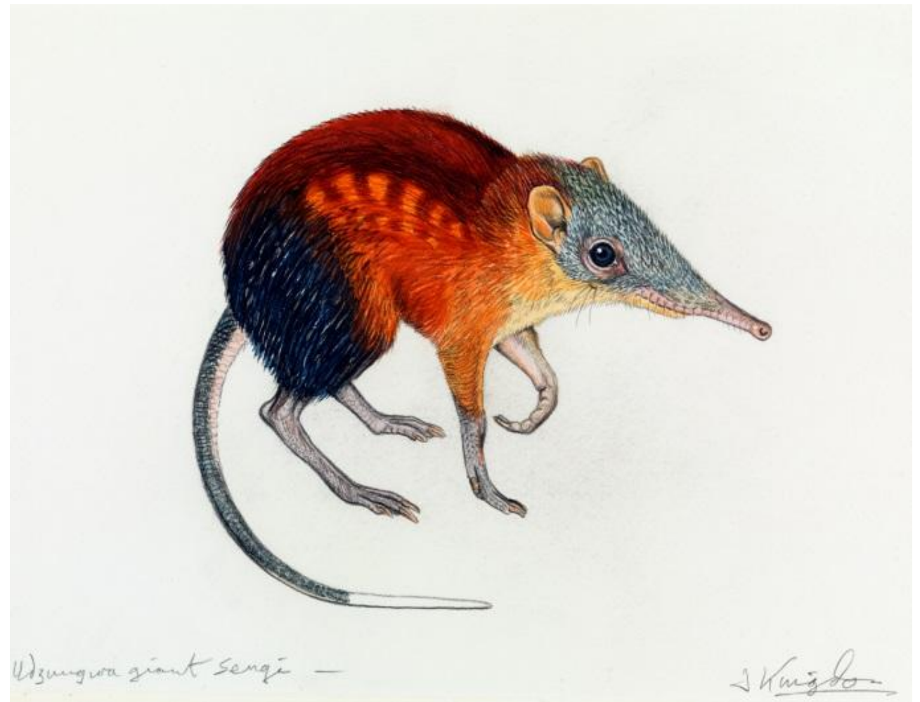
Gray-faced sengi ( Rhynchocyon udzungwensis ) by Jonathan Kingdon