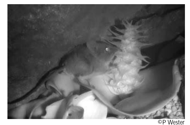
Figure 1. A Cape rock sengi licks nectar from flowers of the Pagoda lily.

Pollination of plants by non-flying mammals, such as mice, is a rarely observed phenomenon. Occasional flower visits of captive sengis were originally interpreted as a by-product of the search for insects and, only recently, was it demonstrated that, under laboratory conditions sengis regularly lick nectar from flowers. Now, field observations of flower-visiting sengis licking nectar have been presented. With video camcorders and infrared lights, Cape rock sengis (Elephantulus edwardii) have been recorded visiting flowers of the Pagoda lily (Whiteheadia bifolia, Asparagaceae) under natural conditions in the Namagualand of South Africa (Fig. 1).