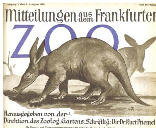
Figure 1. Announcement of the first aardvarks held at the Frankfurt Zoo (Wegner 1925).

improvement of husbandry methods, including better diet and enclosures, and also a general increase in sharing information between zoological institutions, the European population of aardvarks started to take root, and even expand. This was accompanied by the establishment of the first European studbook (ESB) by the European Association of Zoos and Aquaria (EAZA).