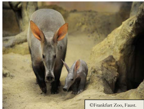
Figure 3. Mother "Ermine" (ESB 194) with daughter "Lotte" at Frankfurt Zoo.

after mating occurred. The average gestation period for the species is 243 days (range = 235-258, n = 6; Taylor 2005). According to Goldman (1986): "young have been born in captivity in all months of the year, with peaks in February, March, and June". At Frankfurt Zoo, these peaks could not be confirmed based on the last two decades (20 births between 1984 and 2006).