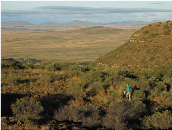
Figure 2. The various habitat types of the studied eastern rock sengi population.

with sweet resin bushes ( Euryops multifidus ); it has relatively flat rocky grassland areas as well as very steep rocky slopes with large boulders. Compared to the KwaZulu-Natal study area, the seasonal changes in our study area are extreme, with mean min/max temperatures ranging between 5°C-20°C in July and 15°C-38°C in January.