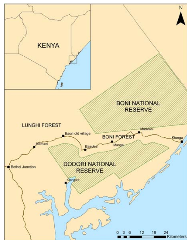
Figure 1. Map of north-eastern Kenya, showing national reserves and Aweer settlements.

In July 2011 we undertook a participatory rural assessment with the Aweer in Mangai, one of the six Aweer settlements (see Fig 1.), to understand more about the interdependence of the people and the ecosystem (Bett et al. 2011). Today perhaps less than 1,500 Aweer people live in the forest and none in the Boni or Dodori national reserves. They depend primarily on crop farming although they have had no formal support in their efforts to become cultivators and most have limited means and little access to agricultural extension and other services or markets. There is also considerable crop damage done by wildlife, especially by buffalos and baboons and increasingly by hippos, whose numbers are reported to be on the increase. All attempts to secure compensation from the authorities for the damage associated with human wildlife conflict have failed. The majority of people remain food-insecure most years. Coping strategies to address the deficit include falling back on traditional hunting and gathering skills, with women and older girls foraging for fruits, tubers, herbs and berries from the forest, and men collecting honey.