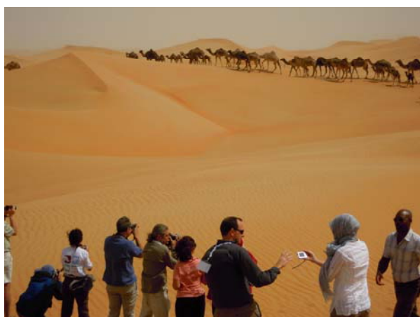
Delegates at the SSC meeting observing the local fauna.