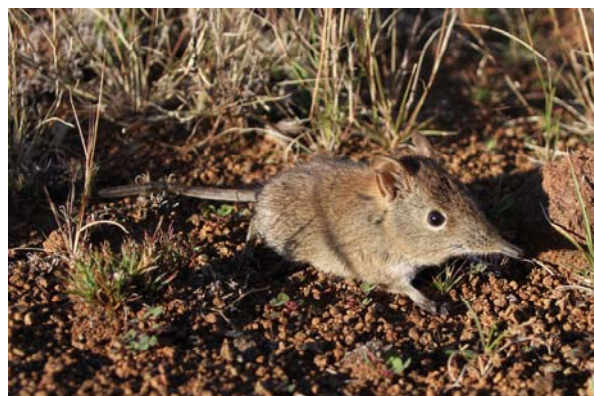
Figure 1. Eastern rock sengi ( Elephantulus myurus ) in its natural habitat at Bethulie, Free State, South Africa.

In April 2012 we started a telemetry study on the eastern rock sengi ( Elephantulus myurus ) in the Free State, South Africa, to gather more information primarily on home range size and use, as well as on longevity.